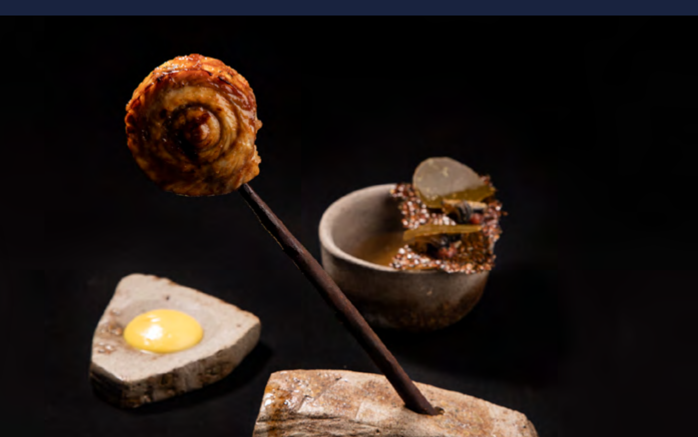
Tommaso Tonioni Lol "eel" pop - honey from the beach & potatoes from the lake