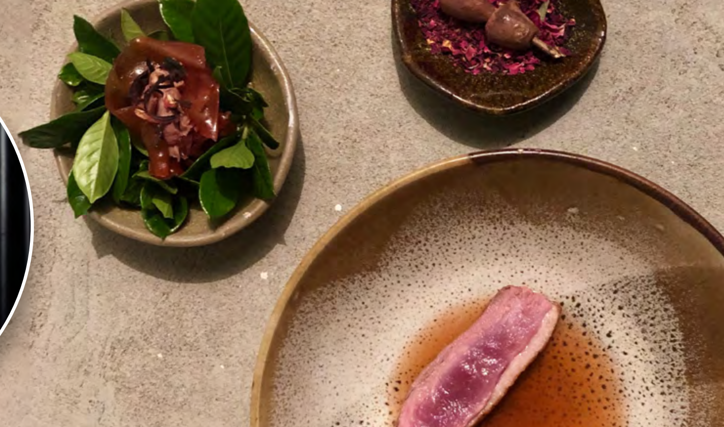
Joshua Gregory Duck and red fruits