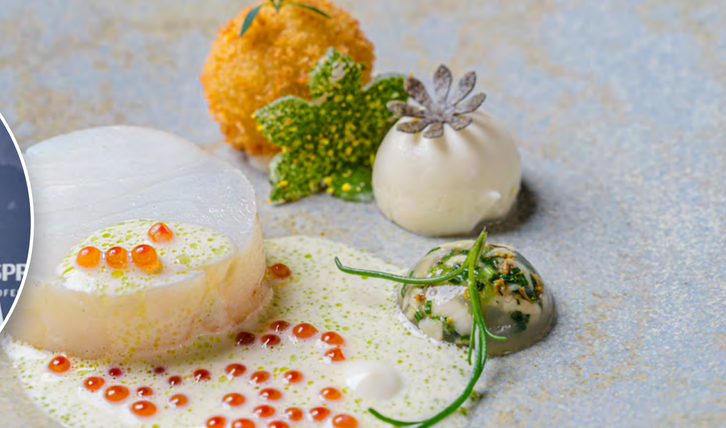
Lari Helenius Different parts of cod, grilled butter, jellied oyster, crispy "muesli" made of grains and cod skin and creamy fish sauce