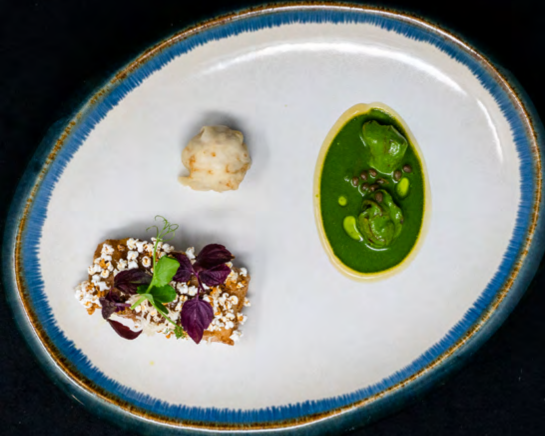
Łukasz Moneta Sturgeon and snails