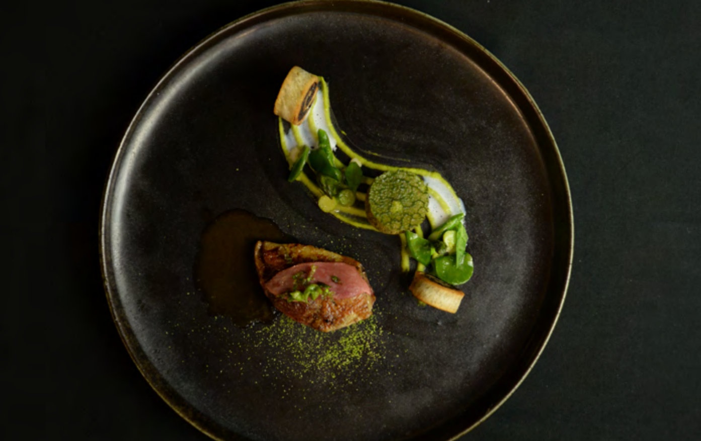
Vivien Rouleaud Beginning of spring... squab returns!