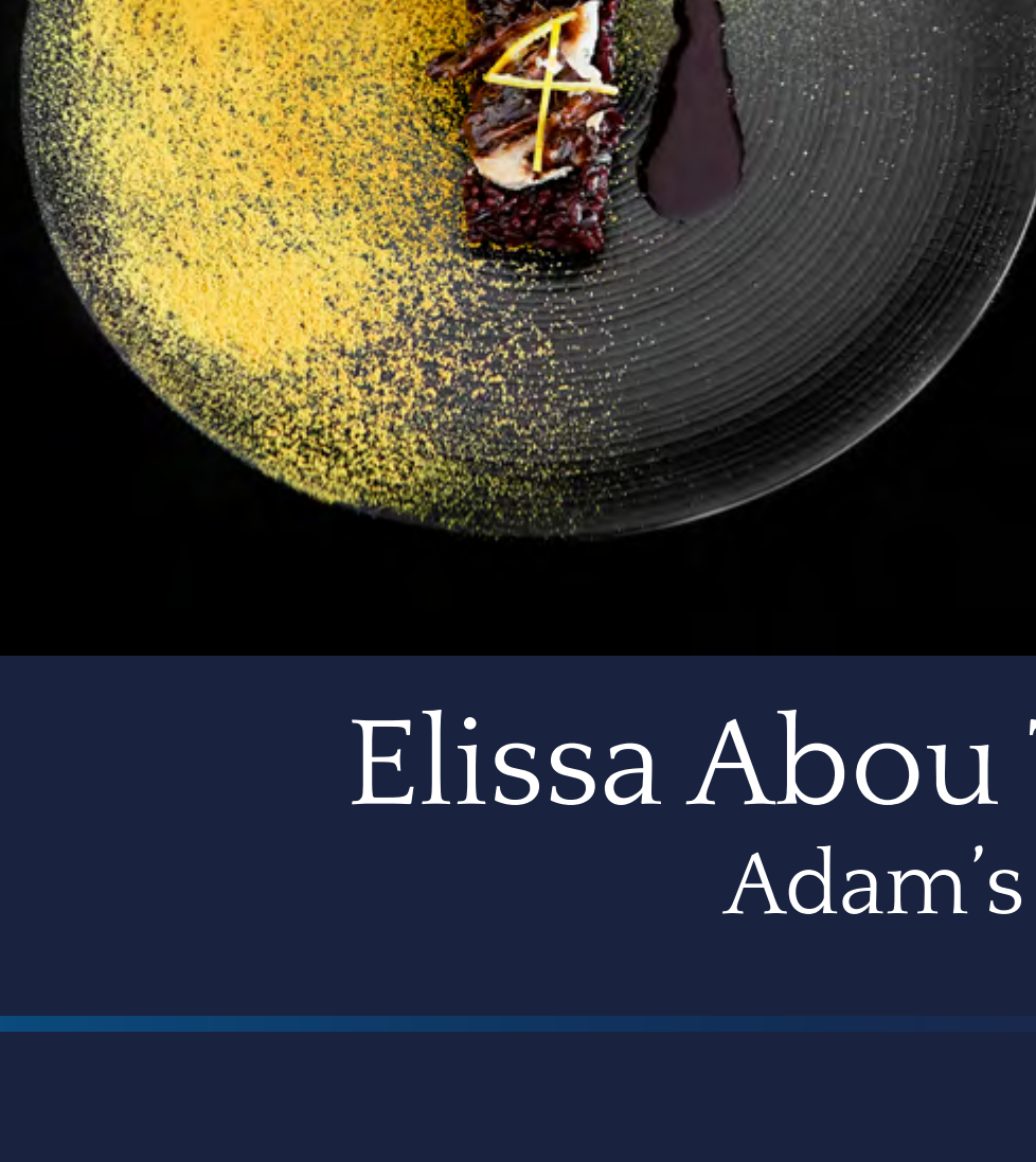
Elissa Abou Tasse Adam's garden