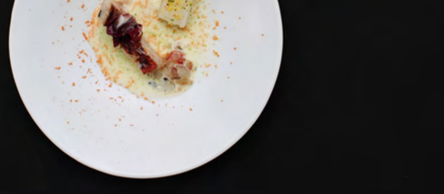
Tor Aik Chua Whole kinmedai with Malaysian elements