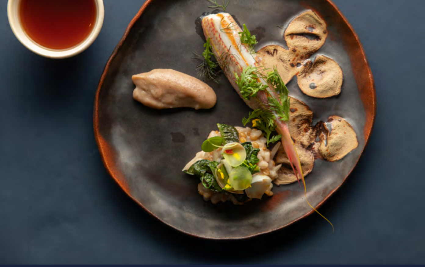
Ho Lam Shek Stuffed and marinated chinese golden thread bream, fermented grains, celtuce, chenpi oil